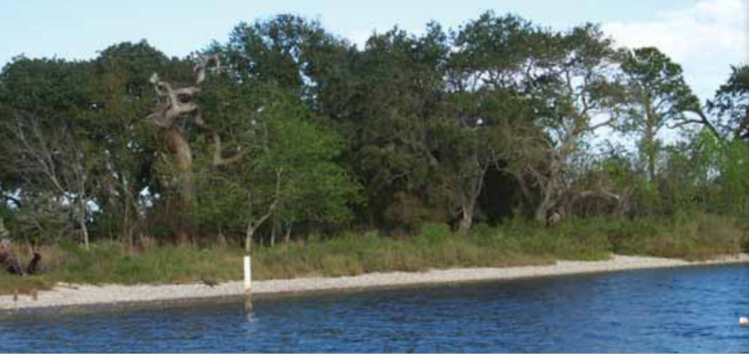
Kenny's Island

provide habitat for a variety of bird species including herons, egrets, and ibises as well as several species of shorebirds including Black-bellied, American Golden, and Wilson's Plover, Willet, Whimbrel, Long-billed Curlew, Pectoral Sandpipers and Gull-billed Tern.