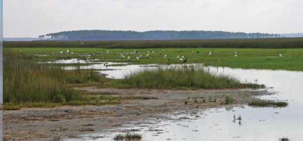
Point aux Chenes Salt Pannes