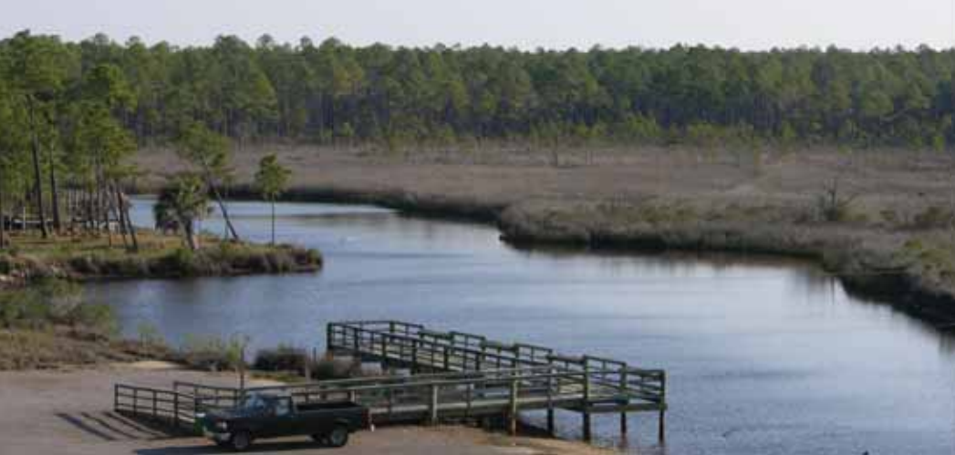
Bayou Heron Boat Launch – Photo courtesy of Jake Walker ©