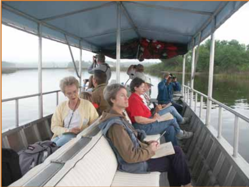
Sunrise birding cruise through the reserve.

as few footprints as possible as you explore some of South Mississippi's most beautiful habitats.