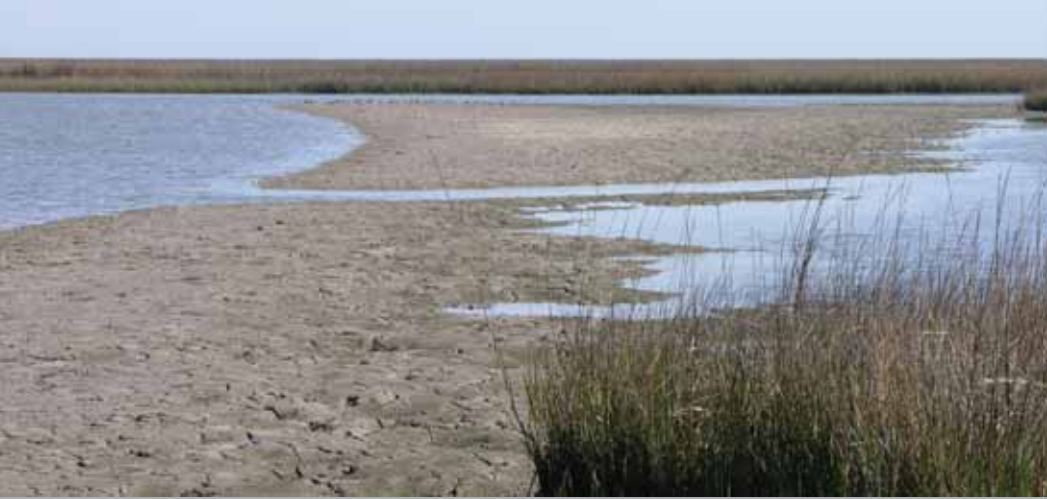
Catch 'em All Bar