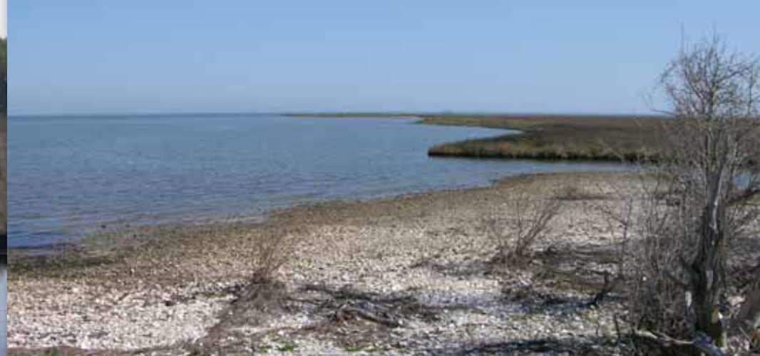
Grand Bay