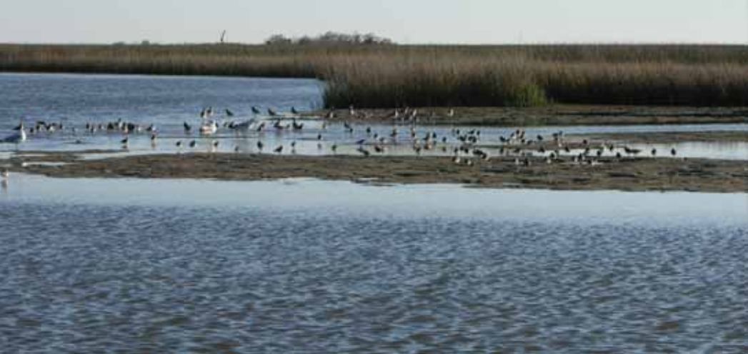
Catch 'em All Bar