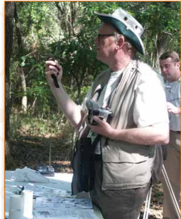
A bird in the hand... – Photo courtesy of Jennifer Buchanan ©