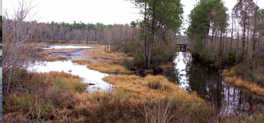
Freshwater Wetlands