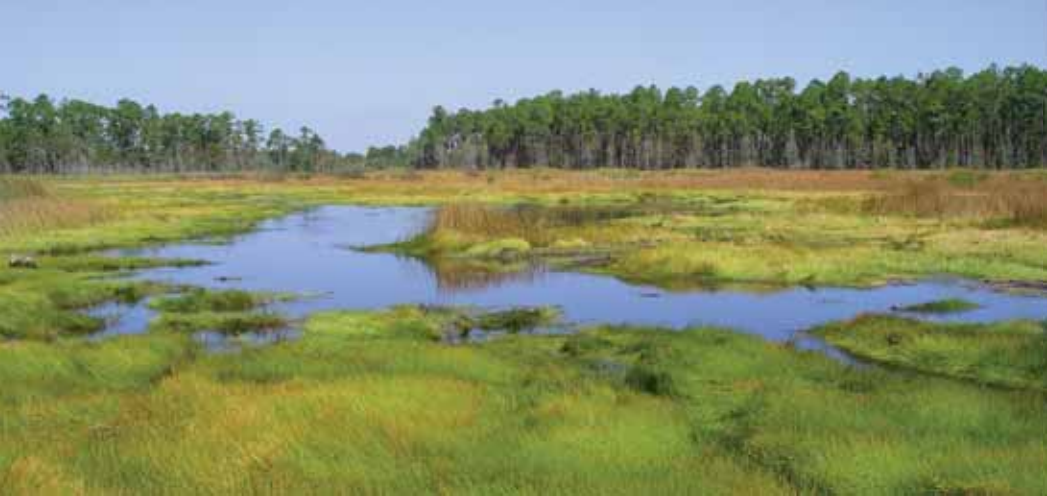
Hawkes' Marsh