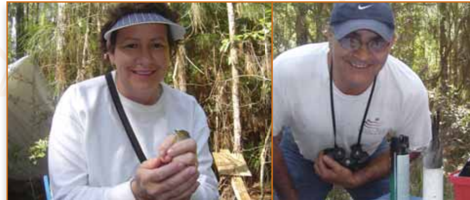
Birding Adventure – Photos courtesy of the Pouriraji's ©