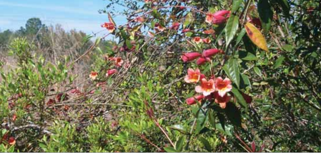
Crossvine in a Swamp – Photo courtesy of Jennifer Buchanan ©

small creeks or oxbows. The largest freshwater marsh in the Grand Bay NERR/NWR area is known as Hawkes' Marsh. Bird species commonly found in this habitat include waterfowl such as Wood Duck, Mallard, and Blue-winged and Green-winged Teal, waterbirds such as Anhinga and marsh birds such as American Bittern, Virginia Rail and Sora, Wilson's Snipe and Boat-tailed Grackle.