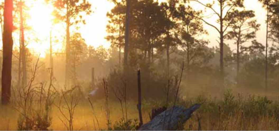
Pine Savanna

The majority of freshwater wetland habitats in the Grand Bay NERR/NWR area are wet pine savannas and flatwoods. This fire-adapted community consists of a well-defined herbaceous layer of vegetation with