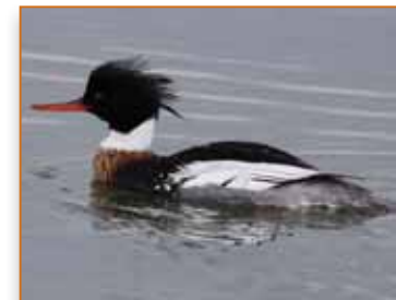
Male above, Female below