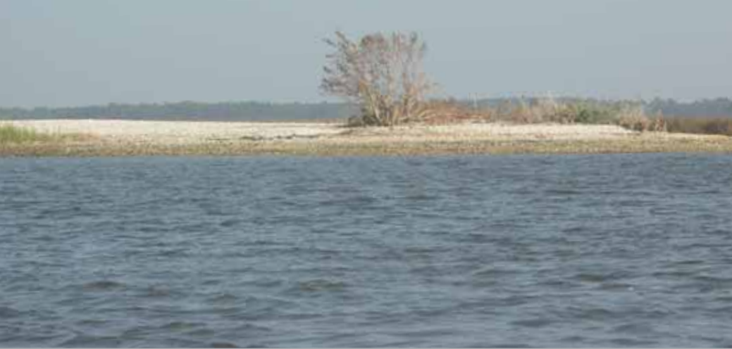
Bang's Island