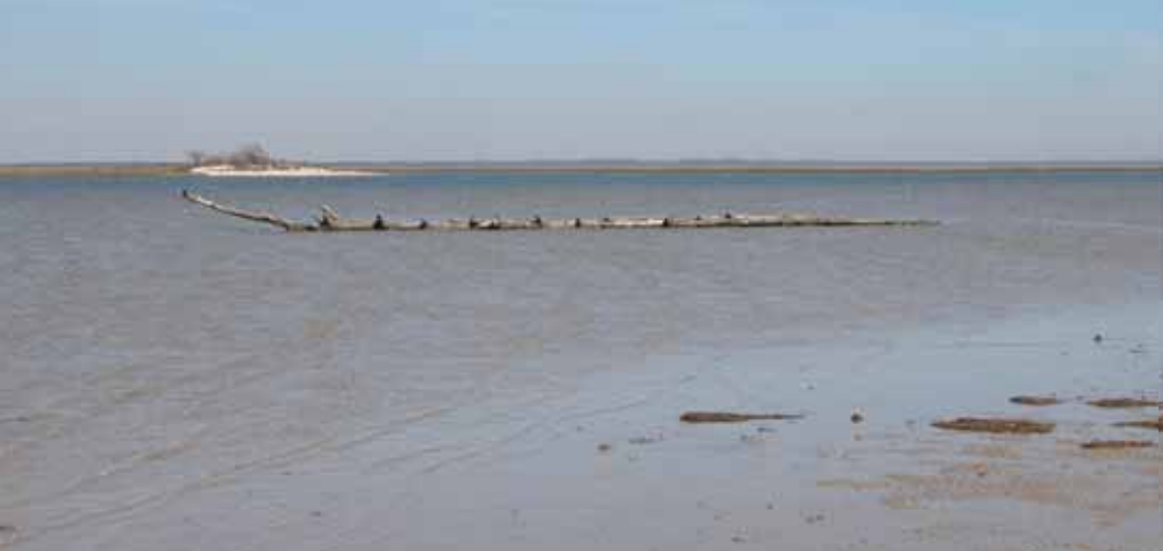
Point aux Chenes Bay