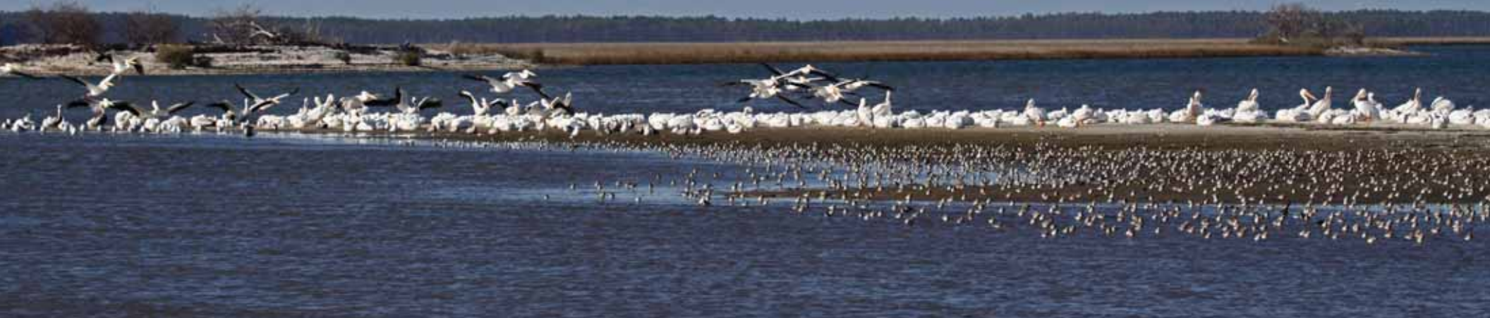
Grand Battures Washover