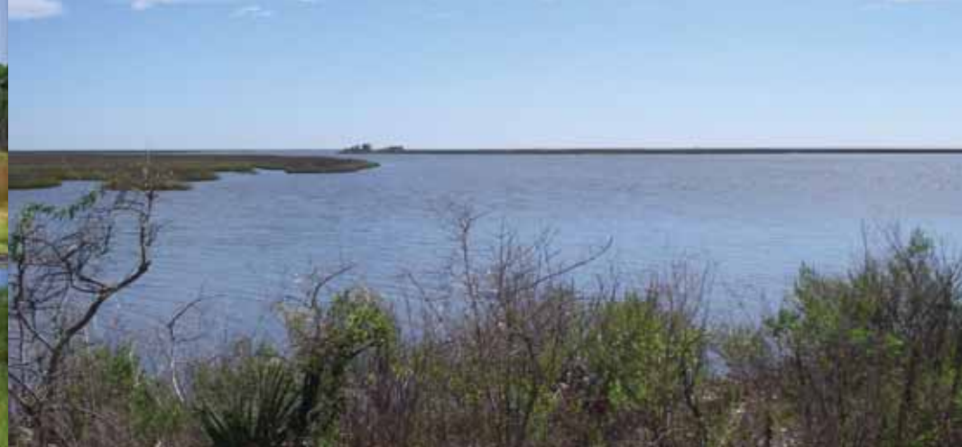
South Rigolets

and Palm Warblers flying across the road. Wilson's Snipe frequent the roadside ditches when they hold water. Orange-crowned Warblers are most easily observed in shrubs along the edge of this road.