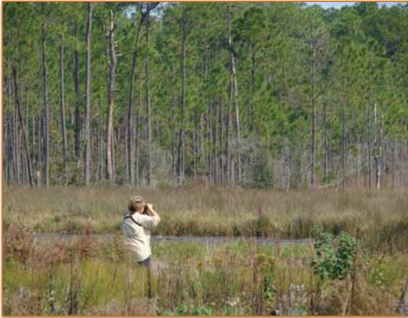
A birder on a guided tour of the Goat Farm

“The Reserve sponsors many unique birding events. On one guided birding trip by boat out to the Grand Battures overwash, we observed a wintering flock of White Pelicans, hundreds of Dunlins, American Oystercatchers, Dowitchers, plovers, ducks and wading birds. The view to the north from the relic islands revealed a stunning, intact natural ecosystem of interconnected forests, rivers, bayous and savannas. To top that, we were treated to a close-up look of Seaside and Nelson’s Sharp-tailed Sparrows. This once-in-a-lifetime trip provided several new life birds for many of the participants!”