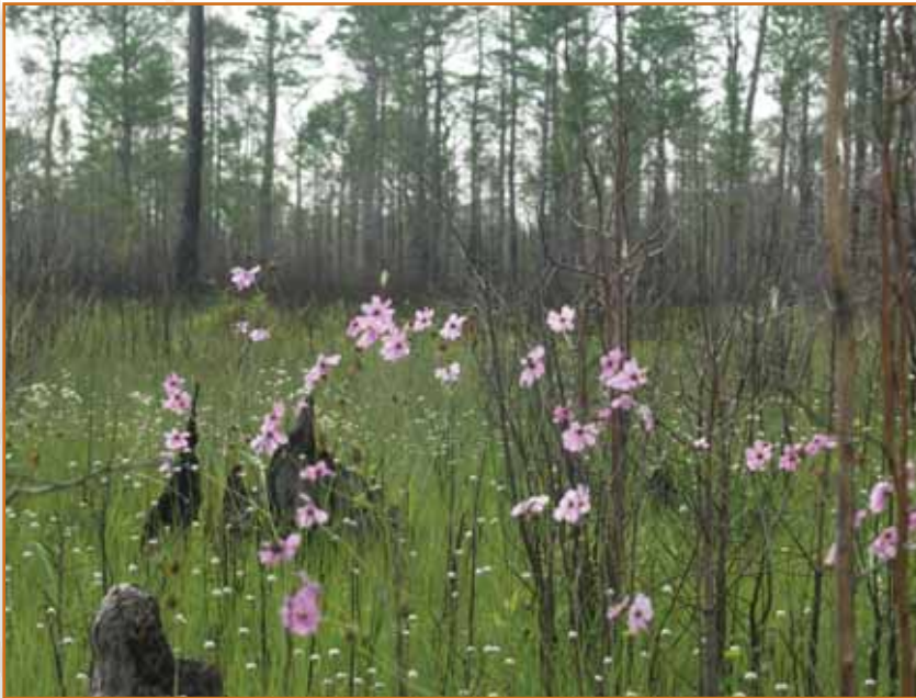
Cypress wetland – Photo courtesy of Jennifer Buchanan ©

Jeff Clark Mississippi Department of Marine Resources Coastal Preserves Program