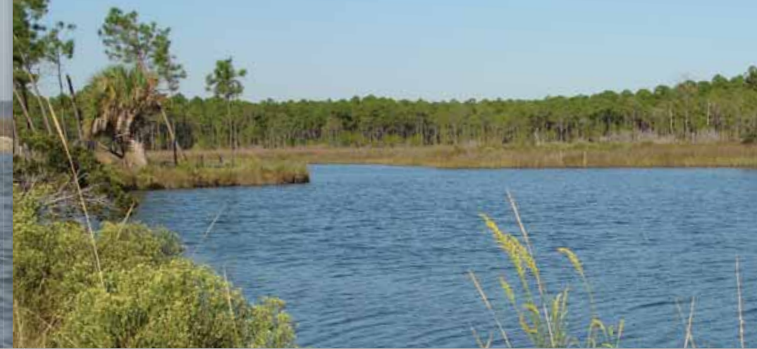
Bayou Heron