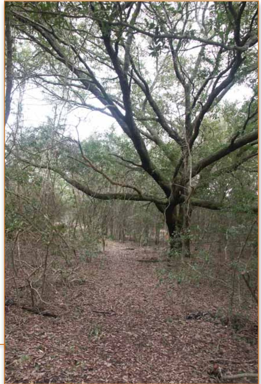
Oak Grove Birding Trail

Swamps are regularly flooded, wooded freshwater habitats dominated by cypress and tupelo gum trees. Bottomland hardwoods are forested freshwater wetlands that are periodically flooded when large amounts of rainfall cause the adjacent streams to flood and overflow into these often dry-looking habitats. These bottomlands are dominated by water oaks, sweet bay, and red maples. Located adjacent to our larger streams, such as the Escatawpa River and Franklin Creek, oxbow lakes, swamps and bottomland hardwoods are critical stopover sites for many migrating birds. Prothonotary and Northern Parula Warblers nest in these habitats during the spring and summer. Barred Owl, Wood Duck and Anhinga can be found here year round.