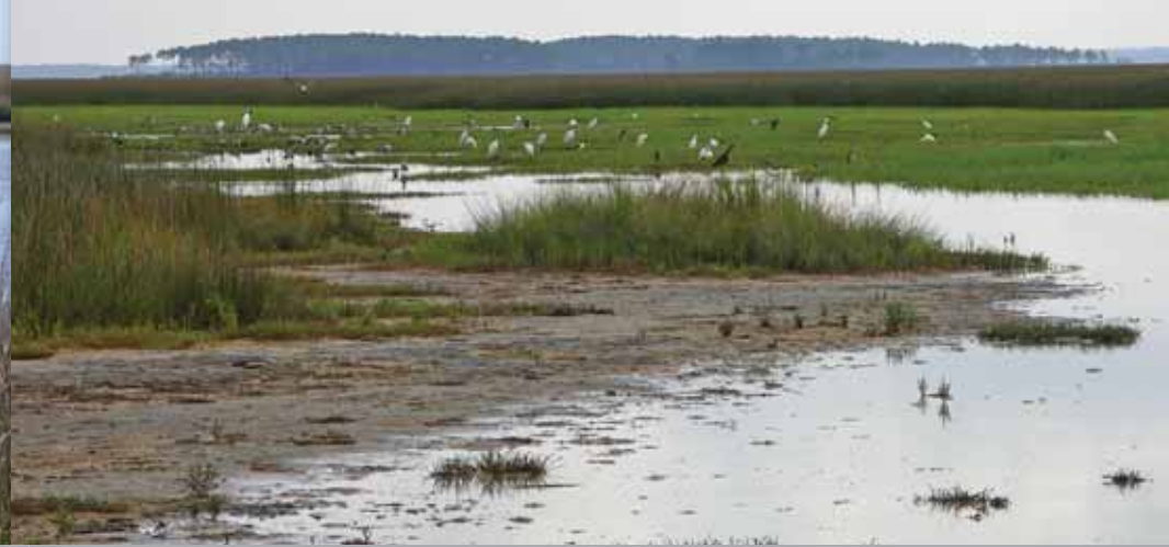
Point aux Chenes Salt Pannes

numbers of wintering waterfowl, such as Redheads and Lesser Scaup, and provide feeding areas for other species such as Common Loon, Brown Pelican, Osprey, Bald Eagle, Laughing Gull, and Caspian, Royal and Least Tern.