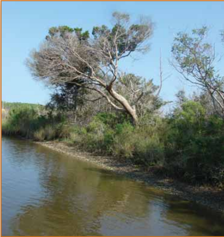
Bayou Heron midden

“After an autumn night of good north winds, our ears were greeted with the ‘pips’ and ‘cheeps’ of call notes while our eyes spotted the small, shadowy figures of hundreds of newly arrived migrant songbirds darting through the island’s shrubs.”