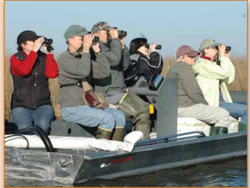
Birders in boat

A publicly accessible database of all birds reported from the Grand Bay NERR/NWR is maintained on the website, www.ebird.org . Please consider reporting sightings of all birds, no matter how common or rare, through this site. Additionally, please stop by the Coastal Resources Center, and record any interesting sightings on our Observations Board. Thank you!