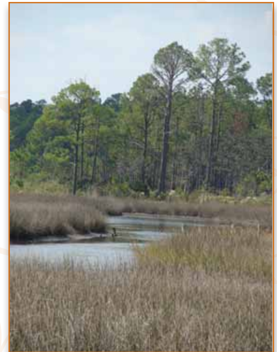
Gautier Bayou