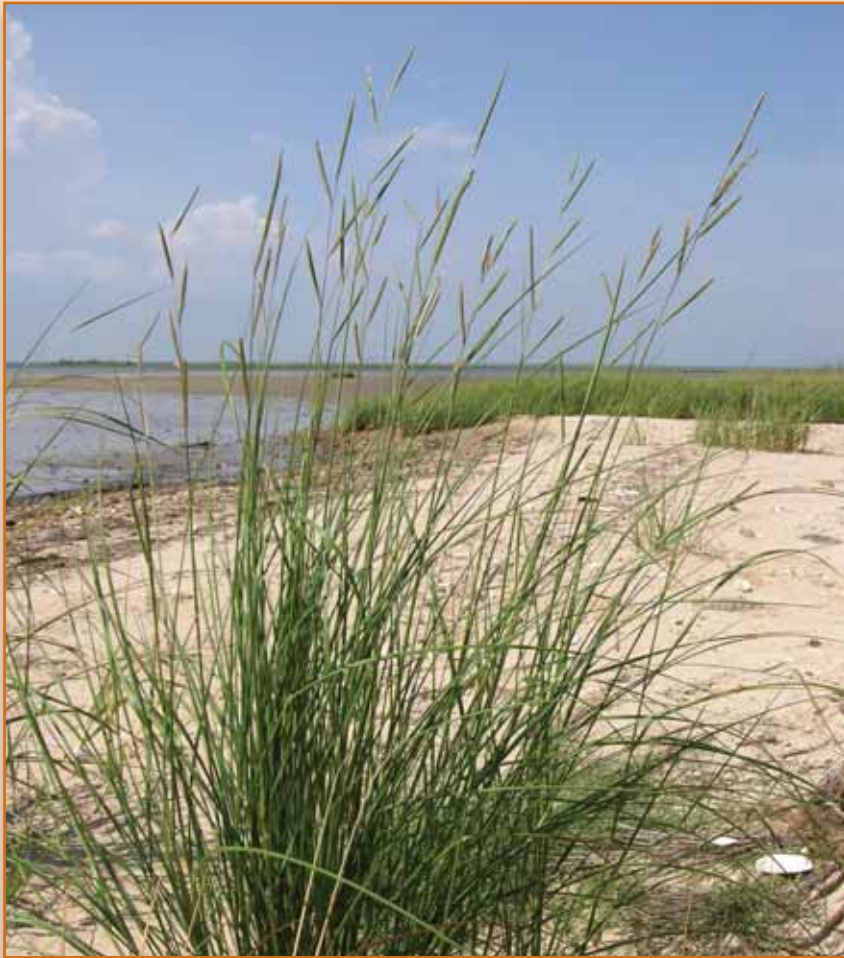
Sand Beach

“Stepping foot on the Grand Bay NERR, it is easy to envision yourself an early naturalist seeing the region’s birdlife for the first time.”